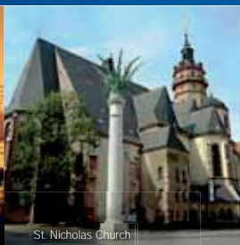
St. Nicholas Church