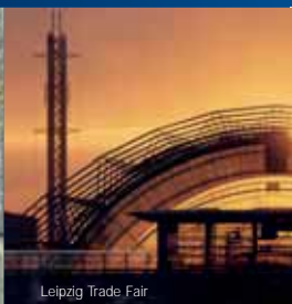
Leipzig Trade Fair