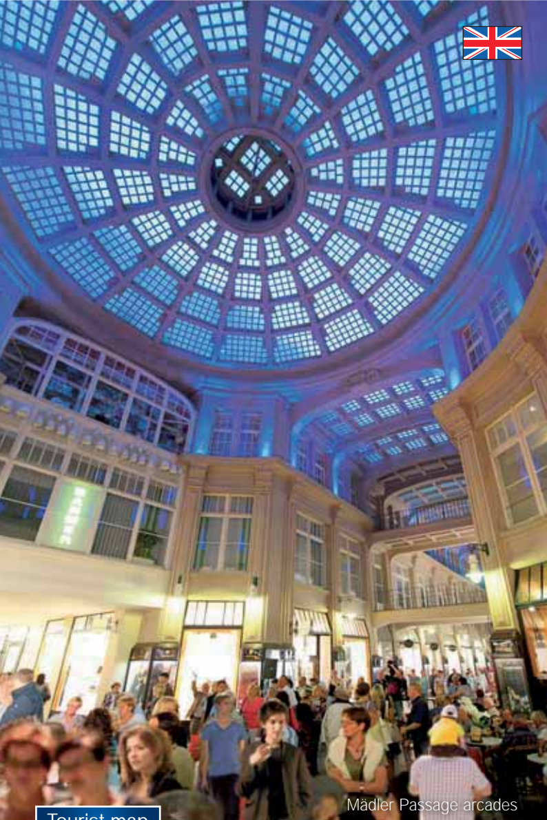
Mädler Passage arcades