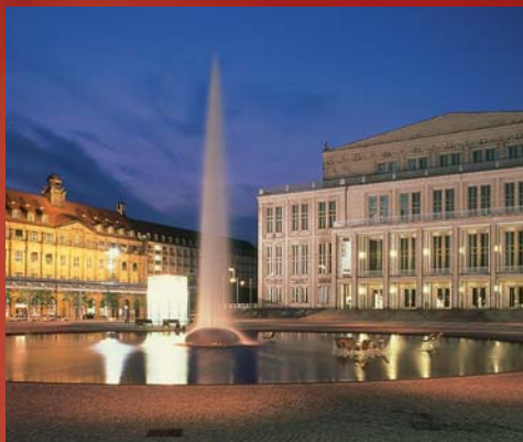
Leipzig's Opera House on Augustus Square