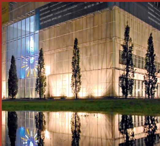
Museum of Fine Arts

Leipzig will give you the best! And not only in music, by the way: The city's fine arts are world famous, too. Visit the studios and galleries of the Leipzig School of painters in Baumwollspinnerei – or experience masterpieces from all epochs in the Museum of Fine Arts. But most importantly – let the charm of this city cast its spell on you, too. Leipzig has a cultural diversity that is hard to match. It is a colourful and creative city, and there is no prescribed closing time. Whether in the streets or squares, whether in concert halls or in pubs – welcome to Leipzig's impressions for ears, eyes and the heart!