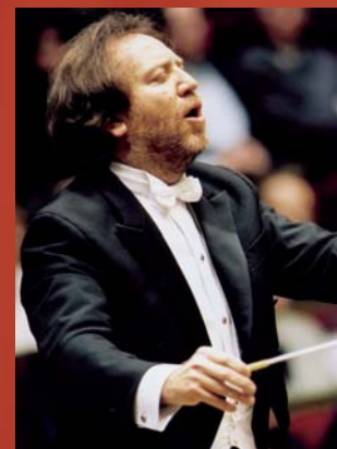
Riccardo Chailly, since 2005, Director of Music, Gewandhaus Orchestra and General Musical Director of the Opera House, Leipzig

Gewandhaus Orchestra is one of the world's most famous orchestras. Many great soloists have played with the orchestra which can look back on a long history of first performances of works that went on to make musical history. The orchestra plays about 70 concerts per season in the Gewandhaus concert hall. In addition, it accompanies the performances at Leipzig's Opera House, performs in St Thomas's Church and plays concerts with St Thomas's Boys Choir. Its current and 19th musical director is star conductor Riccardo Chailly.