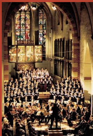
Members of Leipzig's Gewandhaus Orchestra and St Thomas's Boys Choir in St Thomas's Church

Music is the art of making time resonate. And this is exactly what has been going on in Leipzig for centuries. The number of composers who lived and worked here reads like a canon of musical history: Johann Sebastian Bach, Edvard Grieg, Albert Lortzing, Gustav Mahler, Felix Mendelssohn Bartholdy, Clara and Robert Schumann, Richard Wagner, Hanns Eisler... But it is not only the names that are awe inspiring, it is the works performed here too! The city's Gewandhaus Orchestra is one of the great international orchestras, presently working under star conductor Riccardo Chailly. And Leipzig's world famous St Thomas's Boys Choir (Thomanerchor) gives regular performances in the very places where J. S. Bach once worked.