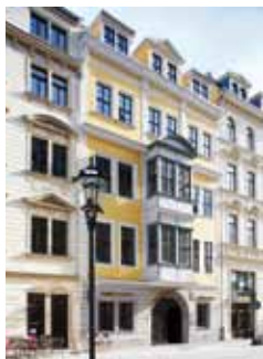
The Bach Museum

The permanent exhibition in the Bach Museum Leipzig presents Bach's life and work in many different ways: sound experiments, multimedia stations and interactive elements as well as precious originals are to be found. A highlight of the exhibition is the Treasure Chamber, in which the original Bach manuscripts and other rarities are on display. At concerts and during guided tours the baroque Summer Hall with its unique sound chamber is also accessible for visitors. The annual highlight in Bach-related events, however, is the international Bach Festival ("Bachfest") in June hosting some 100 events in historical venues such as St. Thomas and the Old City Hall. Even jazz interpretations of Bach's works can be heard.