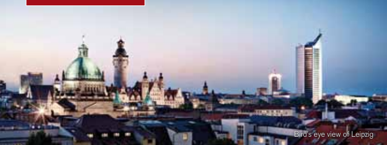
Bird's eye view of Leipzig