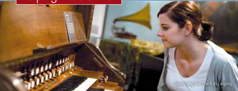
Searching for Bach in Leipzig