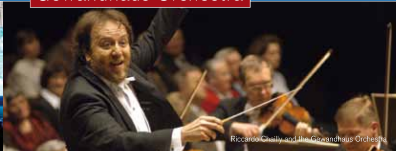
Riccardo Chailly and the Gewandhaus Orchestra