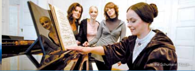
In the Schumann House