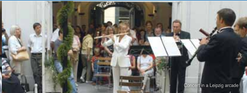
Concert in a Leipzig arcade