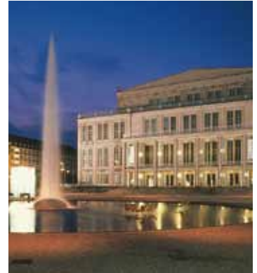
Leipzig's Opera House in Augustus Square