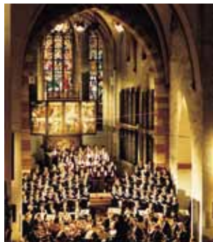
Members of Leipzig Gewandhaus Orchestra and St. Thomas Boys Choir in St. Thomas Church

In Leipzig you can feel the fascinating power of music everywhere – in the streets and squares, in churches, concert halls and in the many authentic places where famous composers and musicians lived and worked. A long-standing tradition: over 500 composers have lived here over the centuries including the greatest names in music history: St. Thomas choir-master Johann Sebastian Bach, Georg Philipp Telemann, Gewandhaus music director Felix Mendelssohn Bartholdy and the married couple Clara and Robert Schumann, as well as Richard Wagner, Edvard Grieg, Albert Lortzing, Gustav Mahler and Hanns Eisler. In addition, Leipzig's rich musical heritage includes the Gewandhaus Orchestra – presently working under star conductor Riccardo Chailly – and the world famous St. Thomas Boys Choir which celebrates its 800 th anniversary in 2012.