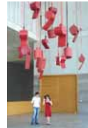
Museum of Fine Arts

Not only musicians felt attracted to Leipzig, but also poets, philosophers and visual artists. To this day the city offers an extraordinary cultural variety in a league of its own: colourful, creative and replete with innovative ideas – to experience with open-air concerts, in the galleries of the Spinnerei (a former cotton mill) or the trendy pubs which have no closing time. But shopping friends also get their full money’s worth. An extensive stroll through the lovingly restored passages, small speciality shops and department stores is worthwhile here. And quite incidentally, you can marvel at the city’s architectural treasures. Well, open your eyes!