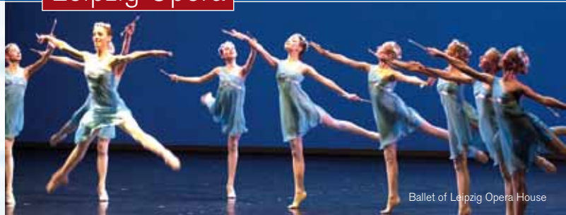
Ballet of Leipzig Opera House