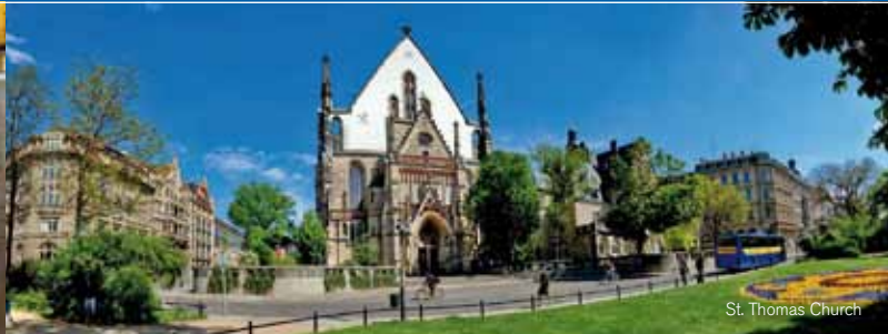
St. Thomas Church