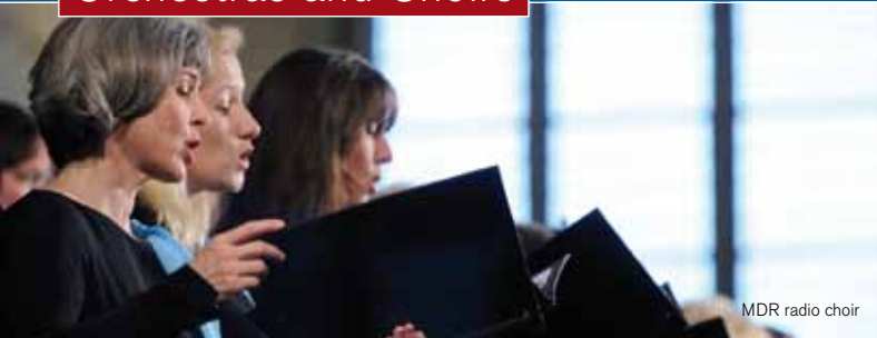
MDR radio choir