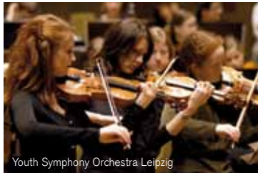
Youth Symphony Orchestra Leipzig

Put four Leipzig musicians in a room and they will found a string quartet the next day – or so a saying goes. Give them a week, and they will set up an orchestra. One thing, however, is certain: the city’s orchestras are legendary. Take the MDR Symphony Orchestra, for example, one of the oldest radio orchestras in the world. Together with the radio choir and the unique children’s choir, the orchestra can be frequently heard performing at the Gewandhaus and at the MDR studios in Augustus Square. Its repertoire ranges from famous classical works to experimental music. Also celebrated among music lovers are the Mendelssohn Chamber Orchestra, the Academic Orchestra Leipzig, the Leipzig University Orchestra and Salonorchester Cappuccino. To sum up – Leipzig is first class.