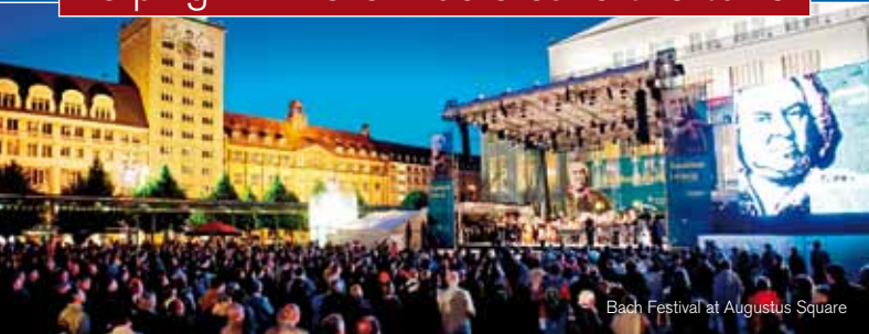
Bach Festival at Augustus Square

In Leipzig you can feel the fascinating power of music everywhere – in the streets and squares, in churches, concert halls and in the many authentic places where famous composers and musicians lived and worked. A long-standing tradition: over 500 composers have lived here over the centuries including the greatest names in music history: St. Thomas choir-master Johann Sebastian Bach, Georg Philipp Telemann, Gewandhaus music director Felix Mendelssohn Bartholdy and the married couple Clara and Robert Schumann, as well as Richard Wagner, Edvard Grieg, Albert Lortzing, Gustav Mahler and Hanns Eisler. In addition, Leipzig's rich musical heritage includes the Gewandhaus Orchestra – presently working under star conductor Riccardo Chailly – and the world famous St. Thomas Boys Choir which celebrates its 800 th anniversary in 2012.